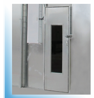
Windowed personnel access doors