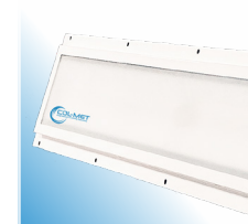
Industry-leading LED lighting with 5-year warranty