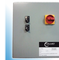
Optional UL & ETL listed control panel