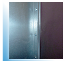
5/16" bolts with serrated lock nut