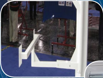
Utility Arm Parts Hangers