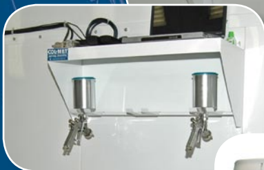
Spray Gun Rack