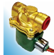
Air solenoid valve