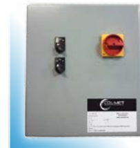
UL & ETL listed control panel