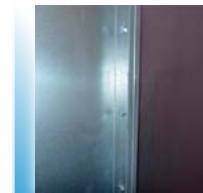
5/16" bolts with serrated lock nut