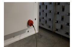
Optional SmartBatch part temperature monitoring

Col-Met's new patent pending SmartBatch technology allows for "real-time" monitoring of part temperature. SmartBatch technology incorporates part temperature probes into the design of the batch oven and control panel for monitoring part temperature during the cure process. The information can then be used to control cure time cycle as well as document the part curing process. The SmartBatch technology allows better control of the cure process, cure temperature and energy consumption thus providing energy savings.