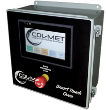
SmartTouch Control Panel