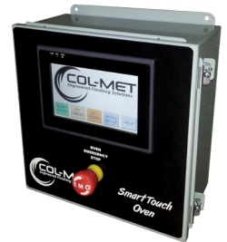
SmartTouch Control Panel

Col-Met ovens are supplied with our industry leading SmartTouch Control Panel. Utilizing the touchscreen interface, the operator can intuitively scroll through the various menu features which include batch timers, alarms, programmable recipes, maintenance schedules and diagnostics. Col-Met ovens are also supplied with our SmartConnect feature which is an APP based program that allows for remote monitoring of the oven parameters and can also be configured to send notifications. Col-Met offers as an option the SmartBatch feature which provides real time part temperature monitoring.