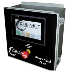
SmartTouch PLC Control Panel

Col-Met's new patent pending SmartBatch technology allows for "real-time" monitoring of part temperature. SmartBatch technology incorporates part temperature probes into the design of the batch oven and control panel for monitoring part temperature during the cure process. The information can then be used to control cure time cycle as well as document the part curing process, providing better control of the cure process.