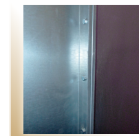
5/16" bolts with serrated lock nut