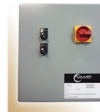
UL & ETL listed control panel