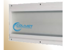
Industry-leading LED lighting