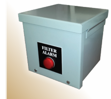
Powder exhaust filter proving assembly