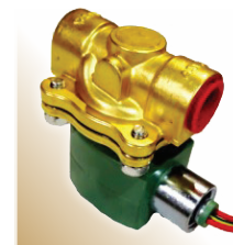
Air solenoid valve